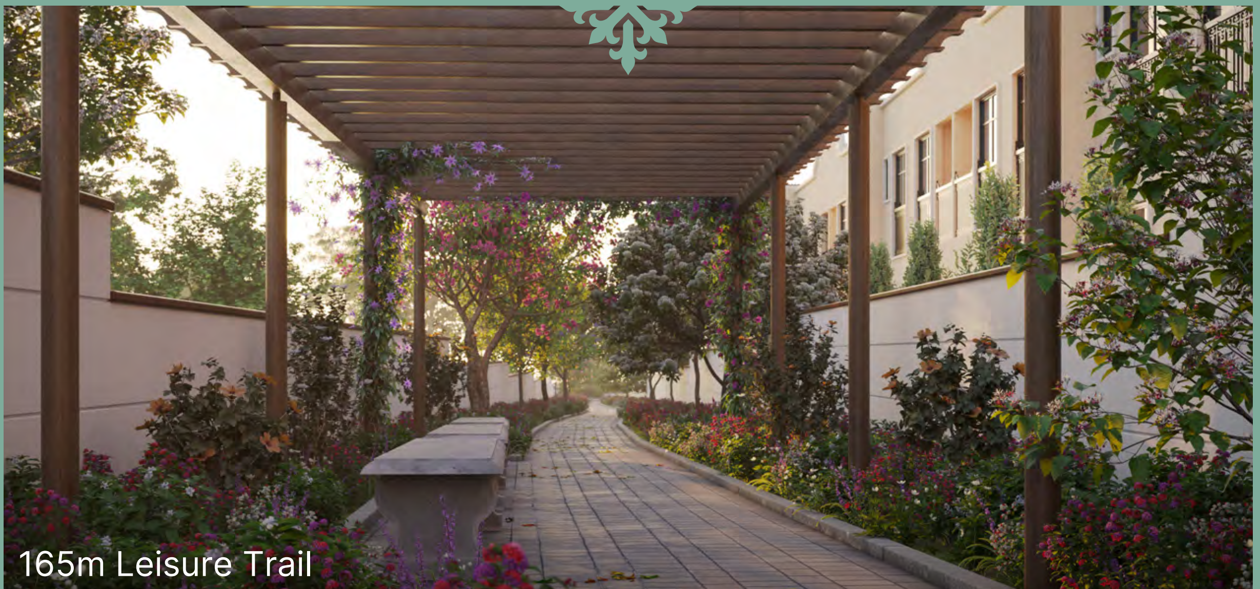
165m Leisure Trail