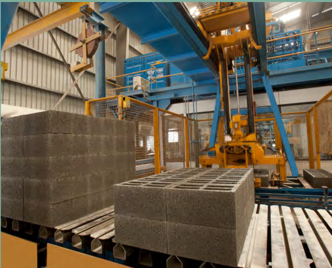
Concrete Products Division Spread across 55,000 sq. ft.