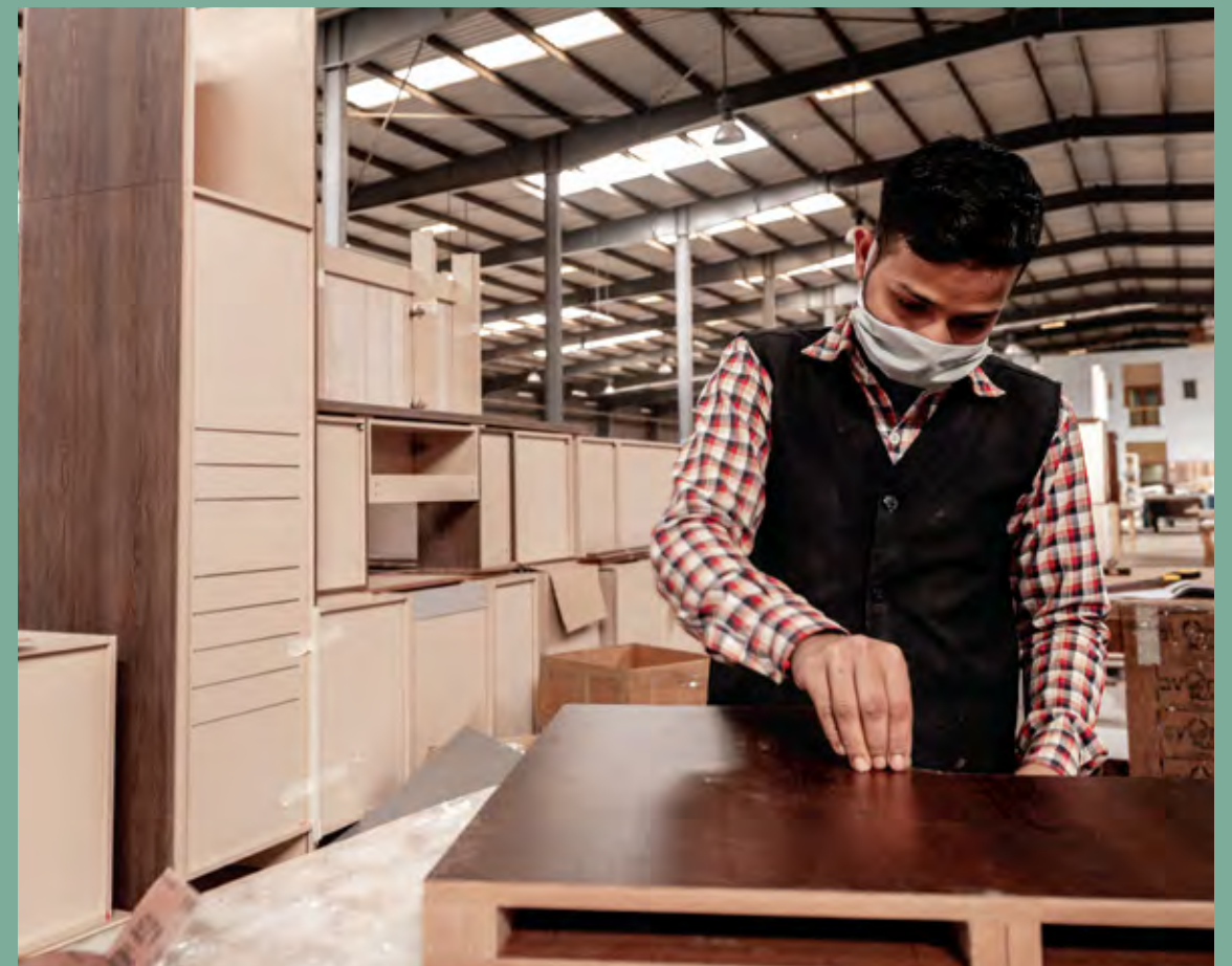
Interiors Division Spread across 3,75,000 sq. ft.