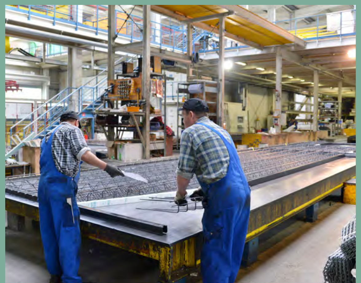
Precast Facility Spread across 73,000 sq. ft.