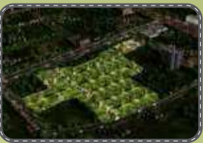
Plots Sized from 800 - 1200 sq. ft.