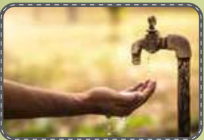
Copious Sweet Groundwater