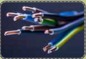
EB Connection Assistance