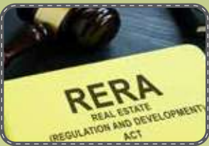
CMDA & RERA Approved Plots