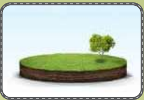
48 Premium Residential Plots