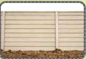
Fully-Compounded Gated Community