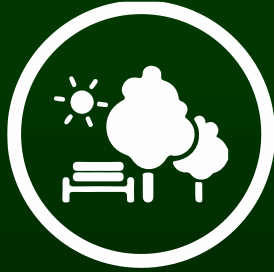
Senior Citizen's Park