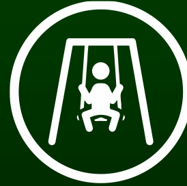
Kid's Play Area